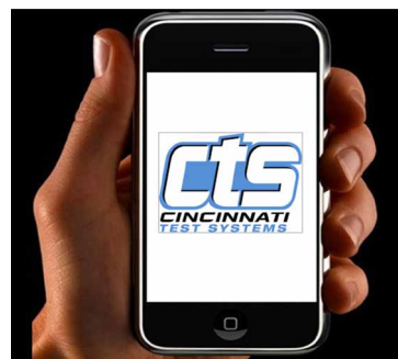
Send text message via email alerts