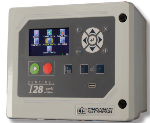
Sentinel I28 Multi-functional leak test instrument